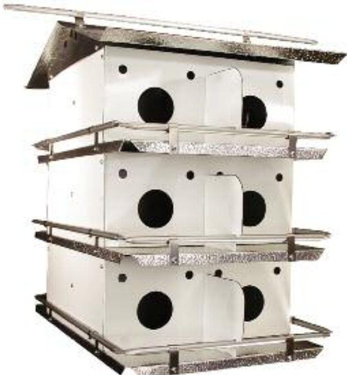
Shown assembled is the PMC12 - 3 Floor Coates Original

Your house is now ready for the mounting pole.